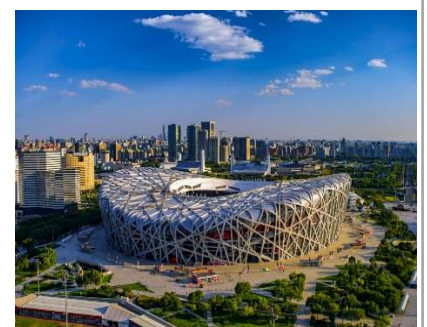
【鸟巢】 为 2008 年北京奥运会的主体育场。奥运会后成为北京市民参与体育活动及享受体育娱乐的大型专业场所, 并成为地标性的体育建筑和奥运遗产