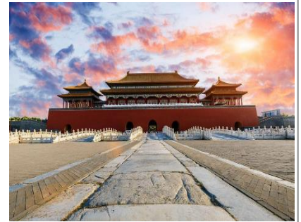
【故宫】 是明清两代的皇宫, 故宫藏有大量珍贵文物, 统称有文物 100 万件