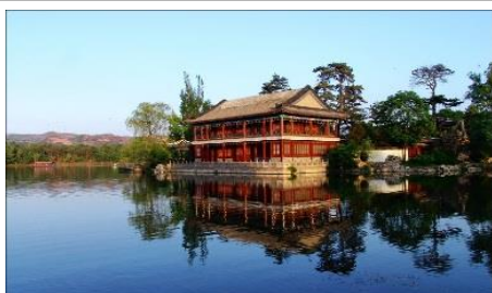
【避暑山庄】 是清代皇帝夏天避暑和处理政务的场所。朴素淡雅为格调, 取自然山水之本色, 成为古代帝王的宫苑

团费包括: 国际国内机票, 托运行李 (20kg), 标准机舱选位, 行程所列明之旅游交通, 酒店住宿, 餐食, 观光景点及主要大门票, 中国签证, 专业导游及司机小费。 团费不含: 超重行李限额, 旅游保险, 个人消费, 行李员小费, 导游推荐自费项目及行程未列明的项目, 自然灾害及航班延误所引起的损失