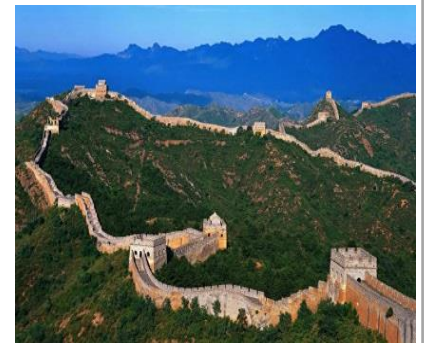
【居庸关长城】 国家级文物保护单位。是北京旅游局评定的国家 AAAA 级景区