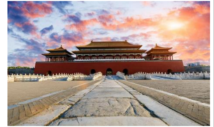
[The Imperial Palace]

It is a palace of the Ming and Qing Dynasties. The Forbidden City has a large number of precious cultural relics, collectively known as 1 million pieces of cultural relics